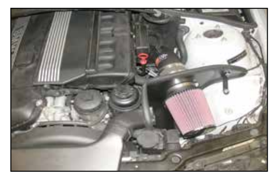
25. Reconnect the vehicle's negative battery cable. Double check to make sure everything is tight and properly positioned before starting the vehicle.