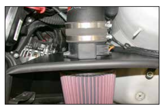
24. Reconnect the mass air sensor electrical connection.