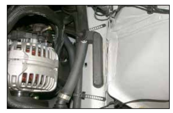
9. Unclip the rubber strap, which secures the heater hose to the lower air box locator.

NOTE: K&N Engineering, Inc., recommends that customers do not discard factory air intake.