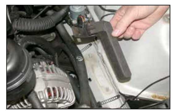
10. Pull up the lower air box locator to remove it from the mounting studs and then from the vehicle.