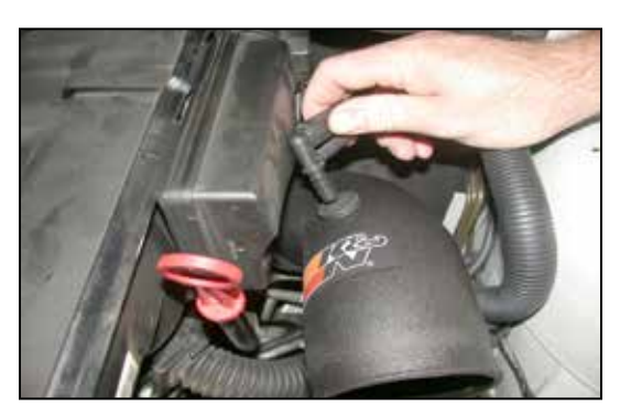
13. Insert the factory vent tube into the grommet in the intake tube as shown.