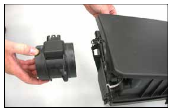
19. Unhook the two mass air sensor retaining clips and remove the mass air sensor from the air box.