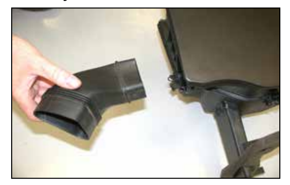
15. Remove the fresh air duct from the air box as shown.

NOTE: Some trimming of the edge trim may be necessary.