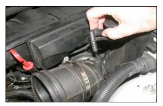
7. Pull up on the vent tube to dislodge it from the intake tube as shown.