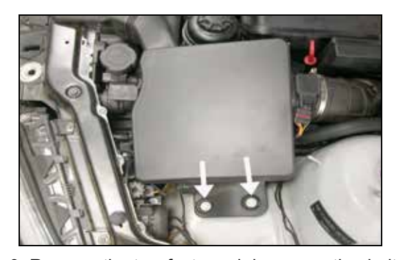
3. Remove the two factory air box mounting bolts

NOTE: Disconnecting the negative battery cable erases pre-programmed electronic memories. Write down all memory settings before disconnecting the negative battery cable. Some radios will require an anti-theft code to be entered after the battery is reconnected. The anti-theft code is typically supplied with your owner's manual. In the event your vehicles' anti-theft code cannot be recovered, contact an