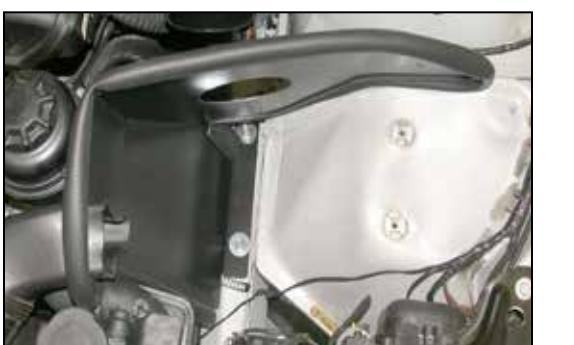
17. Install the heat shield assembly into the vehicle and secure with the provided fender washers and