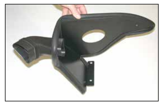
16. Install the fresh air duct into the heat shield as shown.