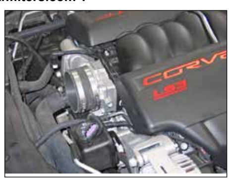
17. Install the provided silicone hose (08761) onto the throttle body and secure with the provided hose clamp

NOTE: Drycharger® air filter wrap; part number RP-5135DK is available to purchase separately. To learn more about Drycharger® filter wraps or look up color availability please visit http://www. knfilters.com®.