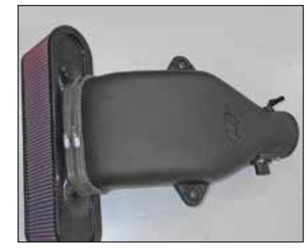
16. Install the K&N® air filter onto the K&N® intake tube as shown and secure with the provided hose clamp.

NOTE: Drycharger® air filter wrap; part number RP-5135DK is available to purchase separately. To learn more about Drycharger® filter wraps or look up color availability please visit http://www. knfilters.com®.