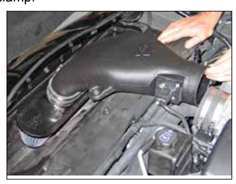
18. Install the K&N® intake assembly on top off the radiator assembly and then connect the mass air sensor electrical connection as shown.