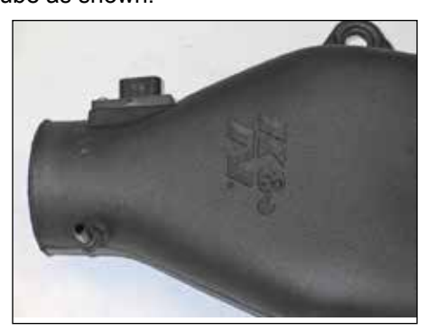
12. Install the factory crankcase vent fitting into the grommet as shown.