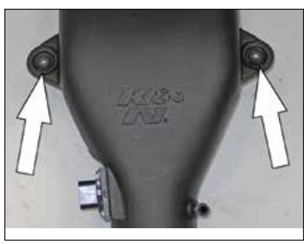
14. Install the two mounting grommets into the K&N® intake tube.