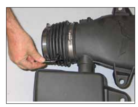
10. Remove the crankcase vent fitting from the stock intake tube.