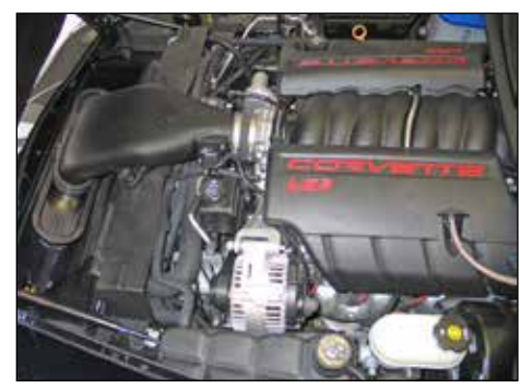
20. Reconnect the vehicle's negative battery cable. Double check to make sure everything is tight and properly positioned before starting the vehicle.

21. It will be necessary for all K&N® high flow intake systems to be checked periodically for realignment, clearance and tightening of all connections. Failure to follow the above instructions or proper maintenance may void warranty.