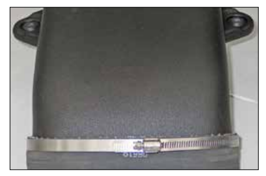
15. Install the provided silicone hose (08619) onto the K&N® intake tube and secure with the provided hose clamp.