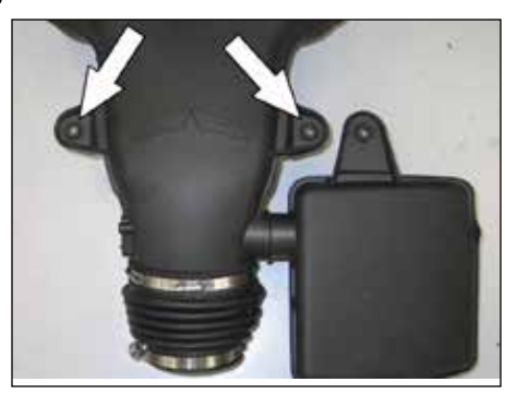
13. Remove the two intake tube mounting grommets from the stock intake tube.