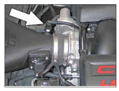
19. Install the K&N® intake assembly into the silicone hose on throttle body and onto the mounting studs. Secure with the provided hose clamp. Reconnect the crank case vent line.