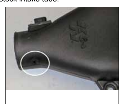
11. Install the provided grommet into K&N® intake tube as shown.