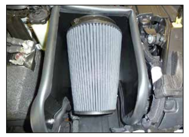
14. Install the K&N<sup>®</sup> air filter and secure with the provided hose clamp.