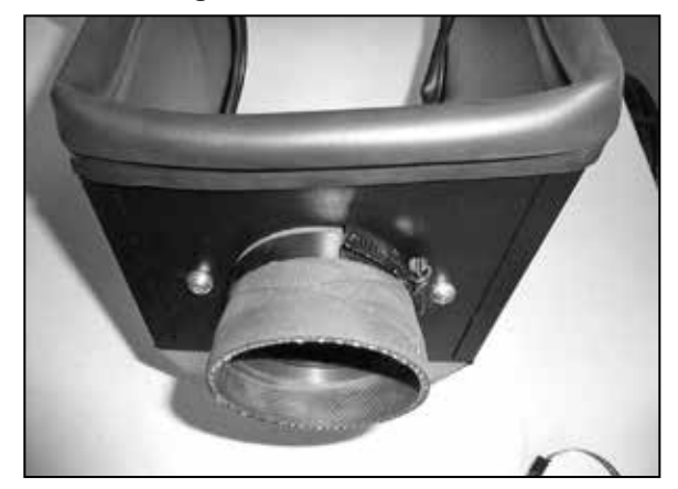
9. Install the air filter adapter onto the heat shield and secure with the provided hardware. Install the provided coupler (08186) onto the filter adapter and secure with the provided hose clamp.

NOTE: The temp sensor is very fragile, use care while handling.