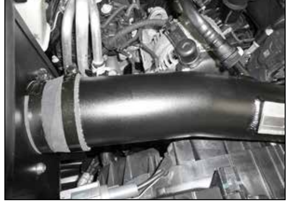
13. Connect the crank case vent line to the K&N<sup>®</sup> intake tube.

12. Install the intake tube into the coupler at the filter adapter and then into the coupler at the throttle body, adjust the tube for best fit and then secure with the provided hose clamps.