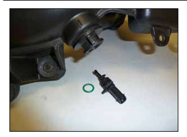
7. Remove the temp sensor from the factory intake tube by gently lifting the tab and rotating the sensor counter clockwise. Once the sensor is removed, remove the sealing O ring from the sensor. NOTE: The temp sensor is very fragile, use care while handling.