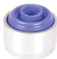
Fit onto bush