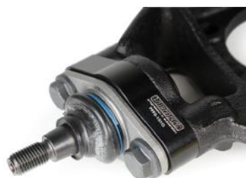
Figure 1- The roll centre adjuster unit without washer