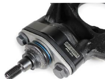
Figure 2- The roll centre adjuster unit with washer